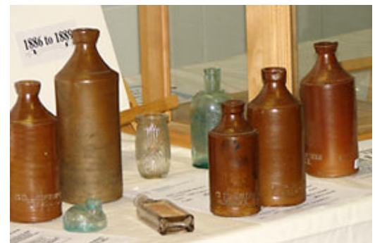
Of the five pottery master ink bottles, 3 are marked "UTICA, N.Y." and 2 are marked "MOHAWK, N.Y."