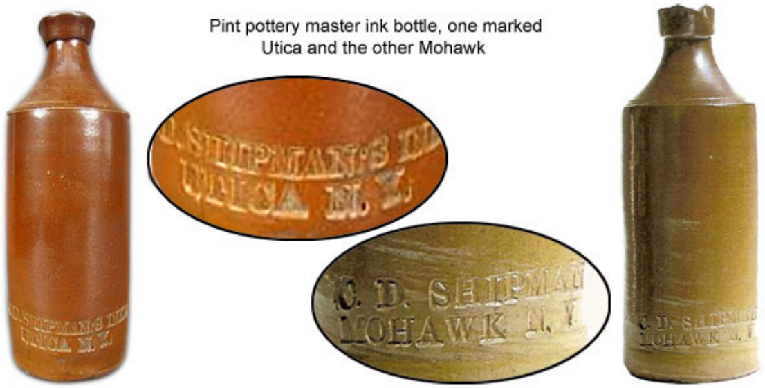
Pint pottery master ink bottle, one marked Utica and the other Mohawk