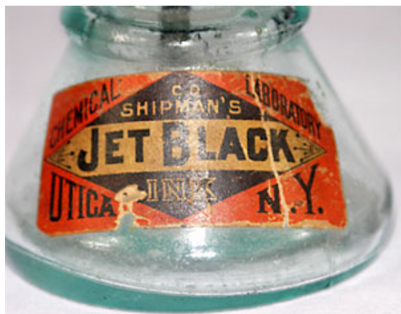
Shipman's aqua cone ink with label – Frank Starczek Collection