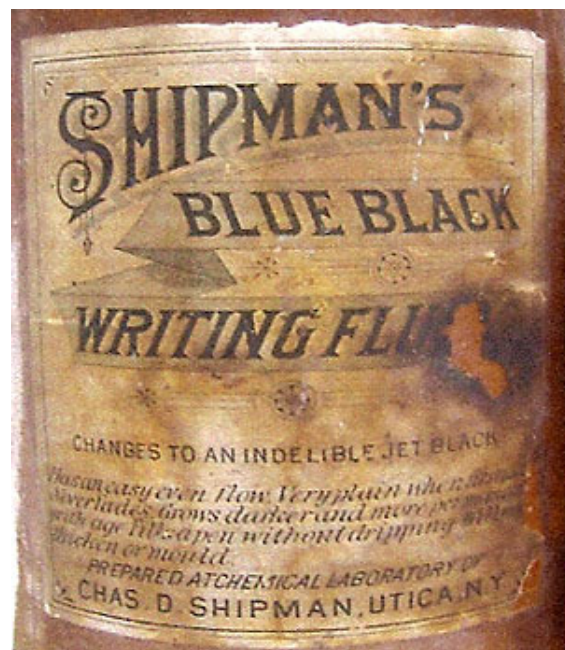
Pottery Shipman's Master Ink bottle with Label.