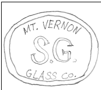
Drawing of shard of Mt Vernon S.G. seal, shown larger than actual size.